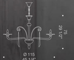
6012 K10 10xMAX 46W E14